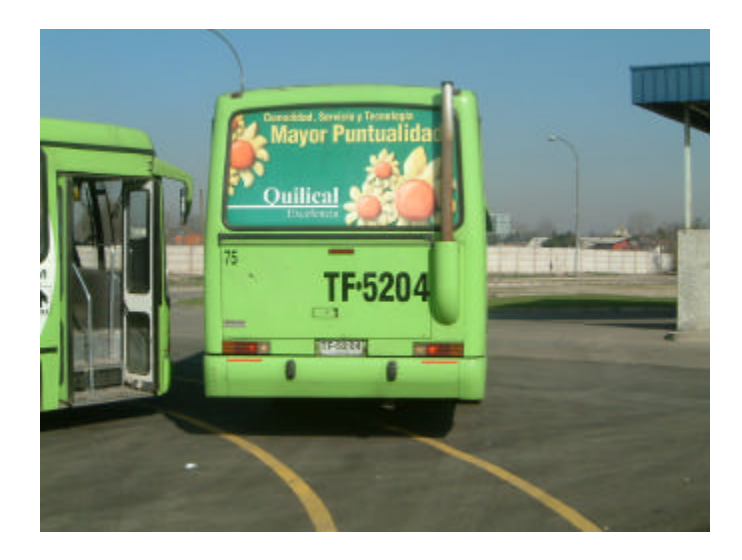
Figure 3. High level exhaust exit.

These buses are fitted with a high level exit exhaust system to help disperse the soot emissions of the conventional vehicle. The external part of the exhaust system at the rear of the bus can be seen in Figure 3.