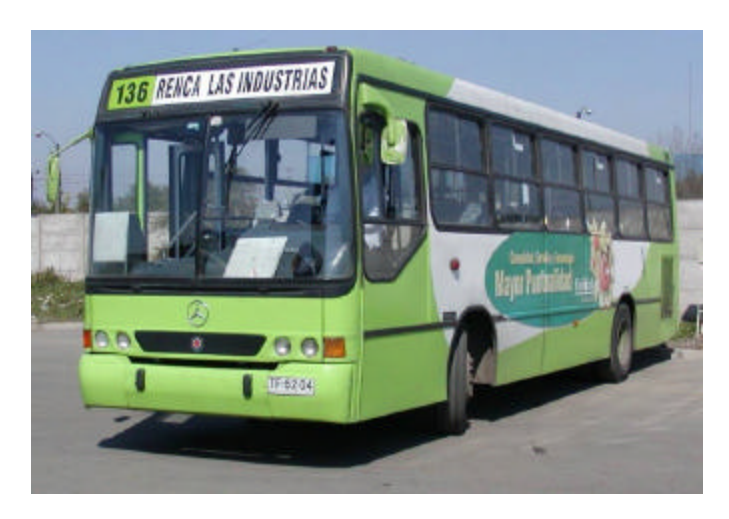
Figure 2. Test bus

The vehicle chosen for this investigation was the Mercedes-Benz OH 1420 bus shown in Figure 2.