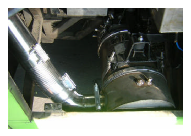
Figure 4. DPF system installed in the bus

A photograph of the DPF installed in place of the original silencer unit, with vertical discharge tailpipe connection, is shown in Figure 4. The FBC container can be seen in the top right hand part of the picture.